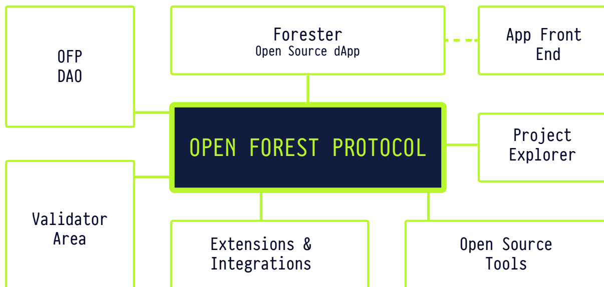
Figure 1: The OFP Ecosystem and Tools for MRV and Entrepreneurs

The Open Forest Protocol is first and foremost a platform that establishes a new ecosystem for managing forestation data in a standardized manner. While the ecosystem's purpose is to create value through regeneration of forests and provide on-chain MRV, it will be characterized by different stakeholders using different facets of the protocol for their own projects: